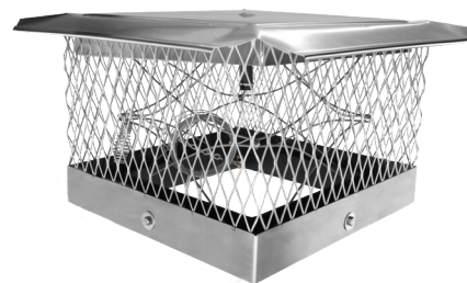
plus TOP DAMPER